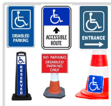
NBC B-3.3 Signs and Cones