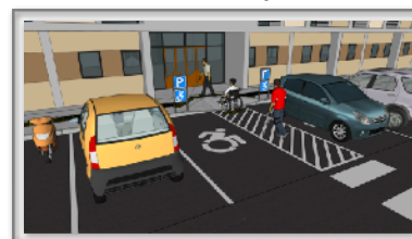
NBC B-3.1 Location