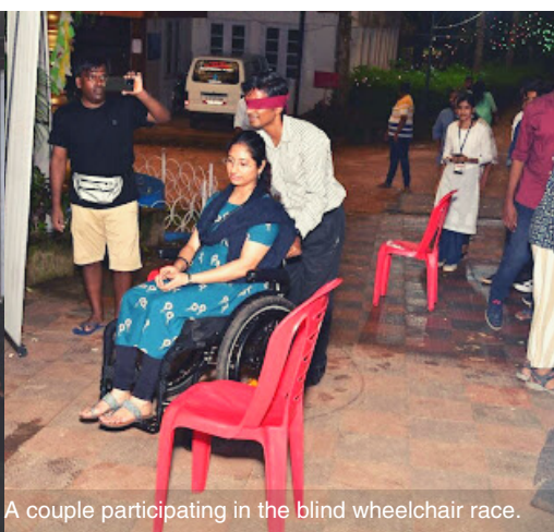
A couple participating in the blind wheelchair race.